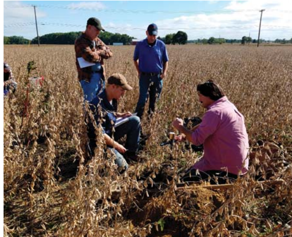
Helping People Help the Land